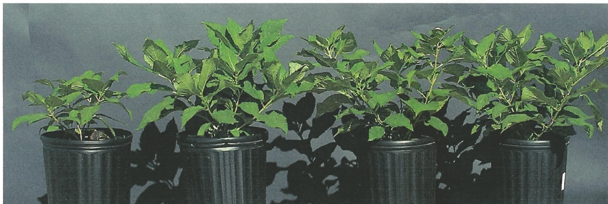
Photo 1. Nikko Blue Hydrangea low phosphorous treatments. From left to right - Treatments 1, 2, 3, and 4 on November 10, 2004.

In the Endless Summer phosphorous trial, Treatment 1 - 0# P_2O_5/yd^3 produced significantly lower height and average spread, and the poorest growth index and quality rating. Treatment 2 - 0.29# P_2O_5/yd^3 produced significantly greater spread and quality rating than Treatment 4 - 0.53# P_2O_5/yd^3 while producing equal height and growth index to Treatment 4 - 0.53# P_2O_5/yd^3 . The low 0.29# P_2O_5/yd^3 rate for Endless Summer hydrangea produced as good or better growth and quality as the normal 0.53# P_2O_5/yd^3 (Photo 2 and Figure 2).