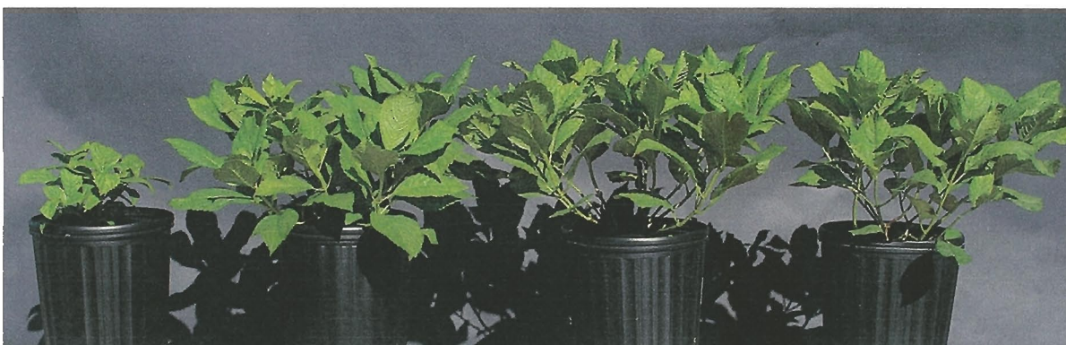
Photo 2. Endless Summer Hydrangea low phosphorous treatments. From left to right - Treatments 1, 2, 3, and 4 on November 10, 2004.

In the Endless Summer phosphorous trial, Treatment 1 - 0# P_2O_5/yd^3 produced significantly lower height and average spread, and the poorest growth index and quality rating. Treatment 2 - 0.29# P_2O_5/yd^3 produced significantly greater spread and quality rating than Treatment 4 - 0.53# P_2O_5/yd^3 while producing equal height and growth index to Treatment 4 - 0.53# P_2O_5/yd^3 . The low 0.29# P_2O_5/yd^3 rate for Endless Summer hydrangea produced as good or better growth and quality as the normal 0.53# P_2O_5/yd^3 (Photo 2 and Figure 2).