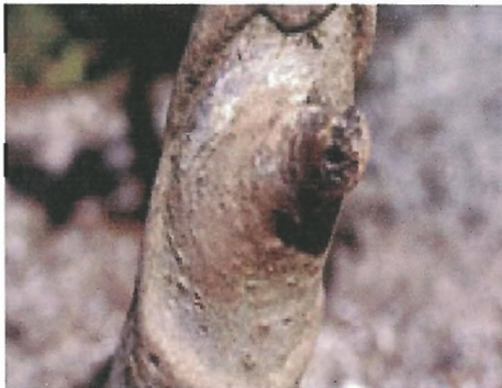
Camellia Dieback caused G. cingulata