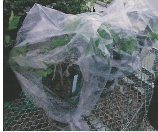
Screening of inoculation methods