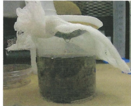
G. cingulata inoculum preparation

Inoculation technique: Due to the suggestions of the CANR board on the inoculation technique to be used and some discrepancies with the inoculation method described widely in the literature, we decided to evaluate the effectiveness of several inoculation methods. Three inoculation techniques were tested: a) mechanical injury with an scalpel followed by an agar plug deposition on injury (Baxter et al, 1982); b) leaf removal followed by a sporidial spray and c) injection using a hypodermic syringe. These three techniques were performed and evaluated. Plants were placed on a high humidity regime for G. cingulata infection. Inoculated and fungicide treated plants were then arranged in a randomized complete block design, using four single replications per treatment. Lesion size and extent of damage on branches and foliage were recorded. The three methods provide satisfactory infection of G. cingulata on camellias, however visual inspection and data showed that the mechanical injury with an scalpel followed by an agar plug deposition on injury and the leaf removal followed by a sporidial spray gave larger cankers and more numbers of branch dieback, therefore these two methods were selected. No statistics were performed in these experiments. However data clearly shows differences.