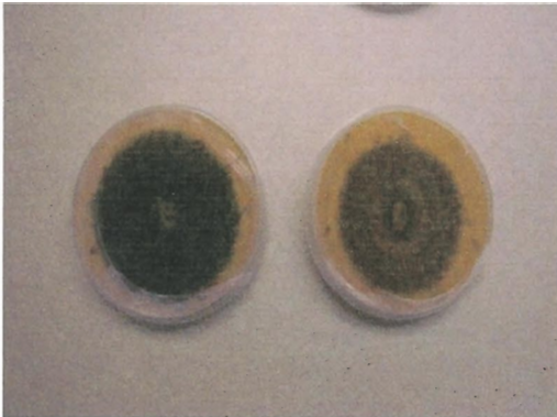
Inoculum of G. cingulata on carrot agar

Inoculum preparation: The fungus was isolated from infected tissue using standard laboratory techniques. Inoculum of G. cingulata was prepared and evaluated in two agar media for the maximum production of spores. Carrot juice agar was prepared as described in Baxter et al, 1982, after 5 days, the fungal colony grown on Petri plates was either dry-scraped using a sterilized scalpel (or a sterilized glass slide) or wet-scraped using distilled sterile water. Four days after the scrape, the inoculum was observed at the microscope and the spores counted. An alternative medium was also evaluated; PD agar amended with chloramphenicol was used to grow the pathogen. The fungal colony was either dry or wet-scraped and evaluated as previously described. Both media produced abundant mycelium and spores. Additional experiments indicated that “hybrid” medium, carrot juice agar which was amended with an antibiotic (chloramphenicol) gave the fastest growth and the mayor number of spores when compared with other media.