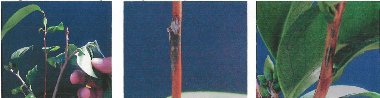
G. cingulata infection on control plants and fungicide-treated plants.

Significantly less infection sites were observed with Azoxystrobin (Heritage) 0.4 oz/100 gal and Trifloxystrobin (Compass) 0.4 oz/100 gal. Propiconazole (Banner Maxx) 8 oz/100 gal. gave a mean of infecting sites of 3.00 and was significantly better than the results given by Thiophanate methyl (Cleary's 3336) 24 oz/100 gal and Actigard 1 oz/100 gal. All treatment had significantly less infection sites than the untreated control. For recommendation purposes the best 3 fungicides were Azoxystrobin, Trifloxystrobin and Propiconazole in that order.