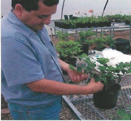
Screening of inoculation methods