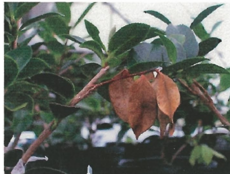
Camellia Dieback caused by G. cingulata –artificial inoculation

Development of an efficient inoculation technique and infection development of Glomerella cingulata on Camellia sasanqua and Camellia japonica .