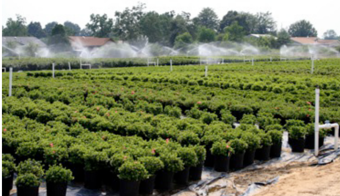
Figure 4. This photo shows two blocks of 3-gallon azaleas ( Rhododendron spp.) grouped by planting date and plant size. The plants being irrigated in the background were planted in 3-gallon containers 12 months before this photo was taken and are two to three times the size of the plants in the bed closest to the camera (not being irrigated) that were planted four months prior to this photo being taken. Grouping plants based on water needs can reduce root pathogens in nursery production.

When organizing new production areas, growers should think about grouping plants together by water-use characteristics. These water-use characteristics can be based on plant age, species or container size.