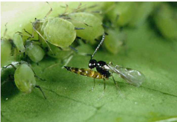
Figure 2. Aphid wasp ( Lysiphlebus testaceipes) adult emerging from aphid mummy.

Help with natural enemy identification can be found at http://www.nysaes.cornell.edu/ent/biocontrol/index.php , which shows many different types of beneficial insects and their method of bio-control. For example, one of the most prevalent insects in ornamental production is aphids. A predator of aphids, the aphid wasp, is shown in Figure 2.